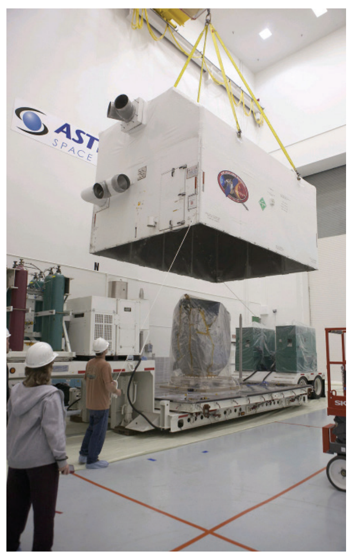
NOAA's Deep Space Climate Observatory spacecraft, or DSCOVR is being unwrapped for the New Year and prepared for launch. In this photo, DSCOVR, wrapped in plastic, comes into view as the protective shipping container is lifted from around the spacecraft at the Astrotech payload processing facility in Titusville, Florida, near NASA's Kennedy Space Center.

ES – Electron Spectrometer is an electrostatic analyzer (ESA) designed to measure solar wind electron in the energy range of 5 electron volts and 1 kiloelectronvolts. The solar wind is composed of equal number of positive and negative charged particles. The Faraday Cup measures the positive ion and the ESA observes the negative electron components yielding independent determinations of the bulk properties of the solar wind. The ESA electron measurements will also provide information for scientists about heating processes that take place as the solar wind streams away from the sun.